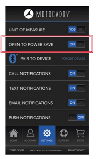
Fig 2 - App Settings